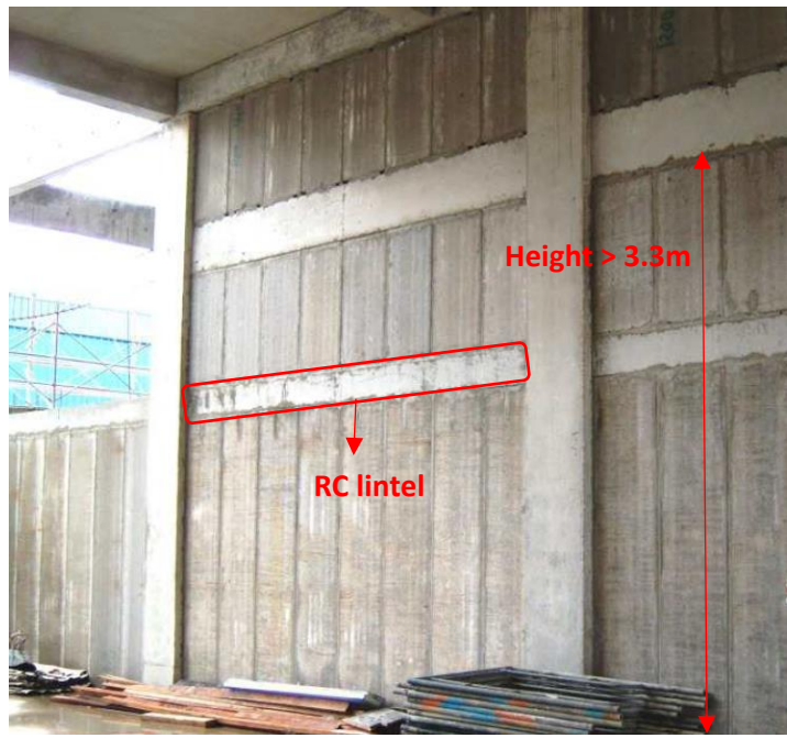
Figure 3: Erected precast hollow concrete wall with RC lintels