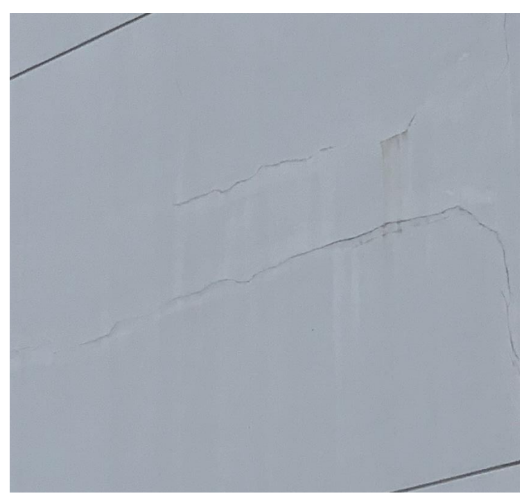
Figure 4: Interface cracks on external non-load bearing wall with no joint treatment