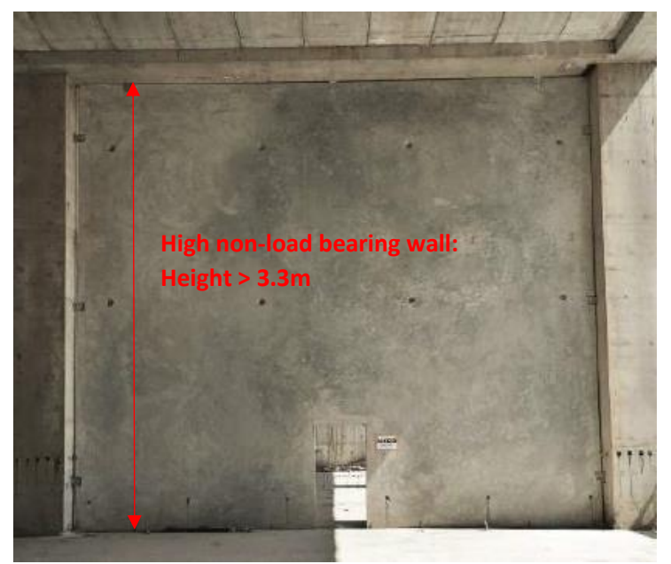
Figure 1: Non-load bearing wall exceeding 3.3 metres is considered as high non-load bearing wall